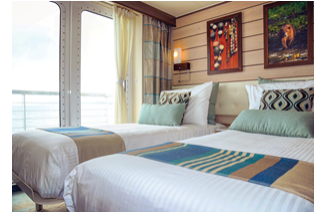
The dining room with large picture windows; Category 4 cabin with lower single beds (which can convert to a Queen) and a private step-out balcony. Select cabins connect via an inside doorway.